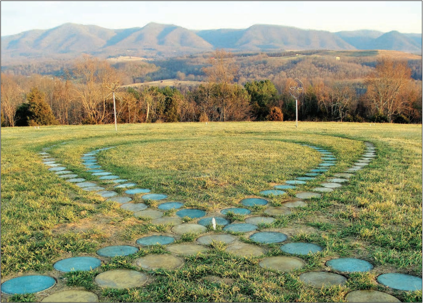
Above: The Grace Walk Right: Infinite Love

and obtaining maximum advantage of The Grace Walk; instructions are available. From personal experience, I can tell you that insights are easily obtainable in this sacred spot of earth. Please do allow yourself to feel this magic. Photos don't do it justice.