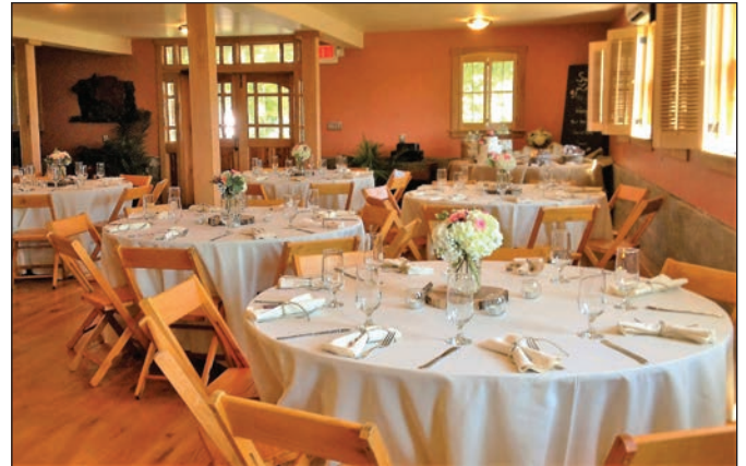
Above: Heartstone banquet

The grounds and the lodge are of such size that there is an almost endless array of events held there: weddings, spiritual retreats and workshops, business seminars,