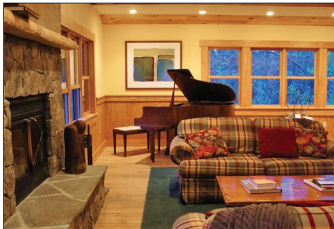
Stonecutter's great room

South River Highlands Country Retreat consists of five restored cabins, walking trails, dense woods, hay fields, and a breath-taking 360-degree views of the Roanoke Valley from the amazing Mount Grace. Mount Grace has an incredible "infinity labyrinth" surrounded by Antonia's metal sculptures. These sculptures, called the Geometries of Love, pulsate with an energy all their own.